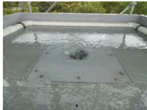
Surcharged flow – 3 L/s (75mm)