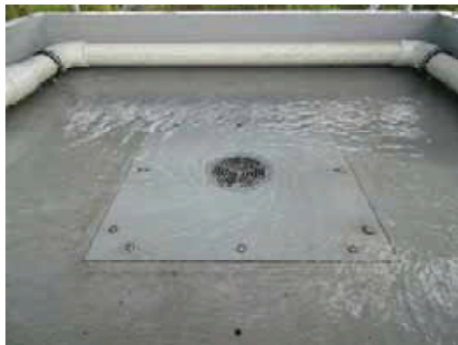
Weir flow - 1 L/s (25mm)